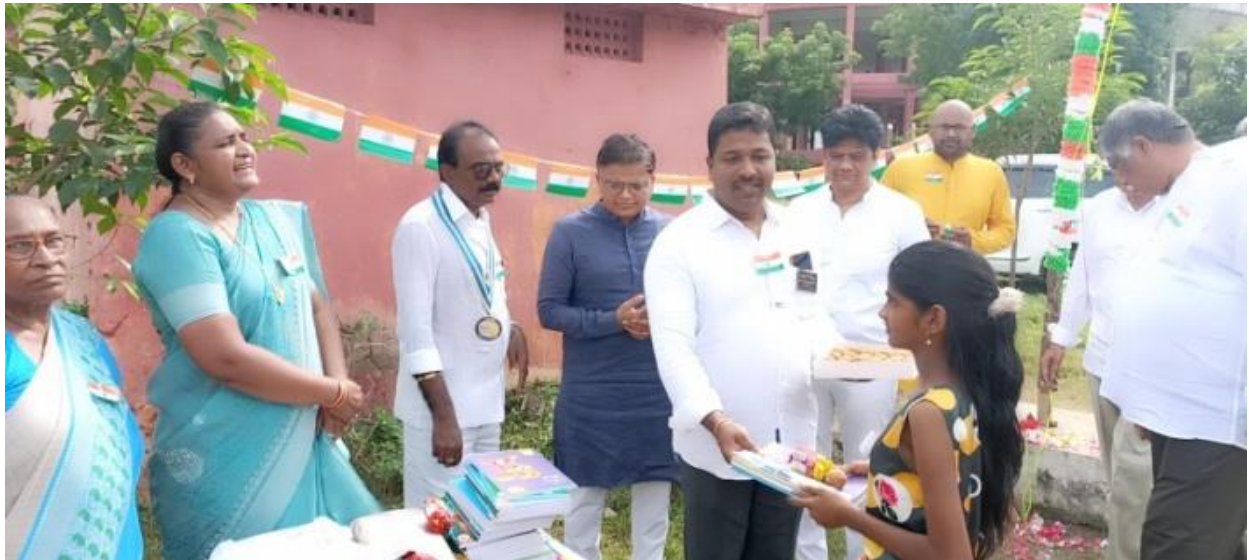
Independence Day Celebrations at Municipal Corporation English Medium Primary School No.98, Kakumanivari Thota, Guntur. Distributed Note Books, Stationery items and sweets & biscuits, on 15th August, 2024