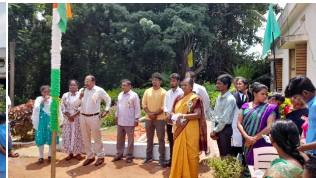
Independence Day Celebrations at HEAL Children Village, Chowdavaram on 15th August, 2024