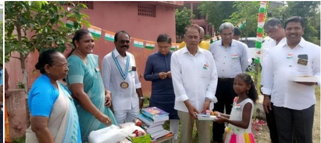
Independence Day Celebrations at Municipal Corporation English Medium Primary School No.98, Kakumanivari Thota, Guntur. Distributed Note Books, Stationery items and sweets & biscuits, on 15th August, 2024