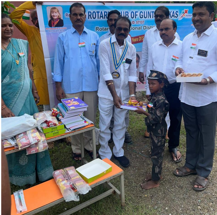
Independence Day Celebrations at Municipal Corporation English Medium Primary School No.98, Kakumanivari Thota, Guntur. Distributed Note Books, Stationery items and sweets & biscuits, on 15th August, 2024