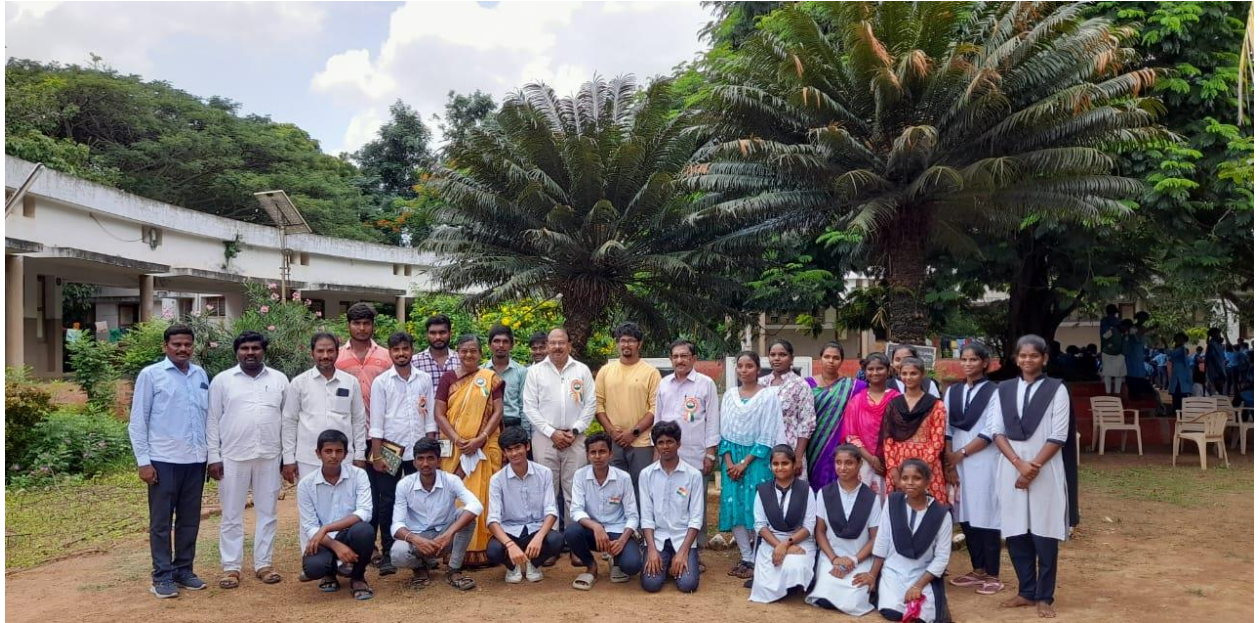
Group photo taken on the occasion of Independence Day Celebrations at HEAL Children Village