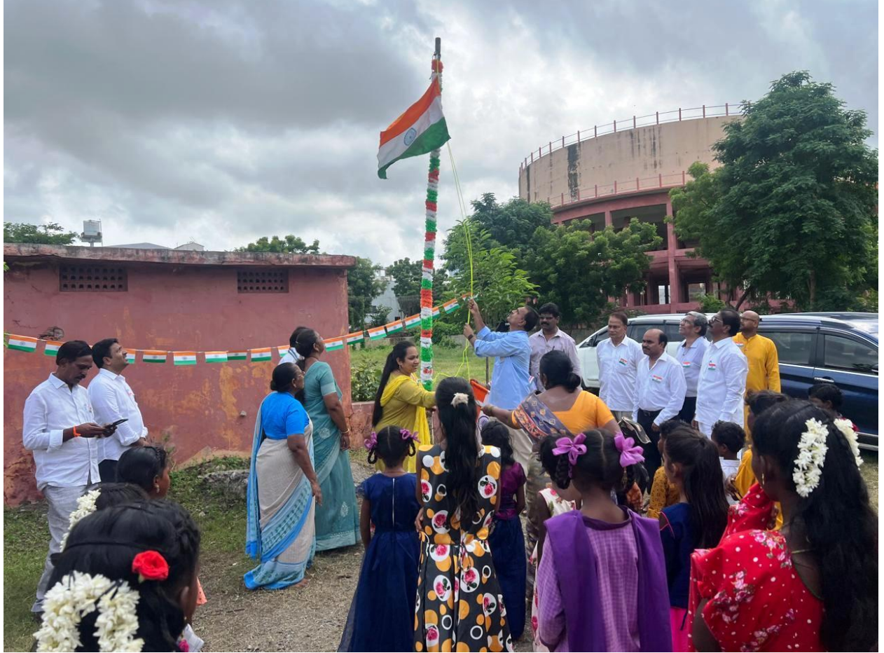
Independence Day Celebrations at Municipal Corporation English Medium Primary School No.98, Kakumanivari Thota, Guntur.